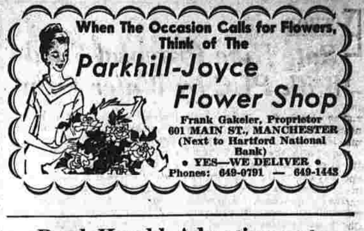
Read Herald Advertisements